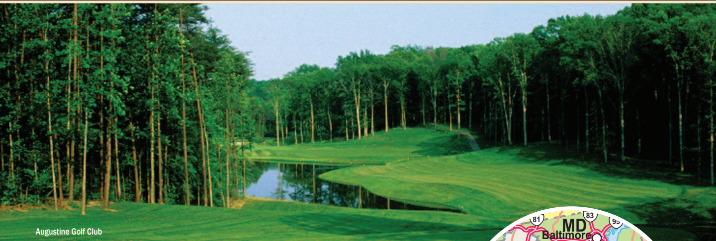
Augustine Golf Club

Battle in Virginia's Fastest Growing golf destination. Southern golf starts here with incredible values, variety, hospitality in half the drive from other destinations.